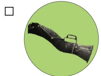
Flexible Arm Series SAL