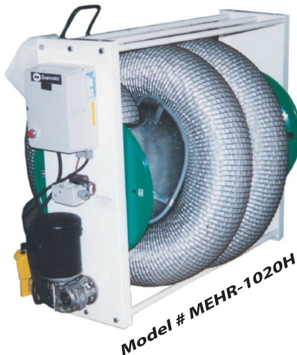
Model # MEHR-1020H

The future is clean air ... the future is Sourcetec ®