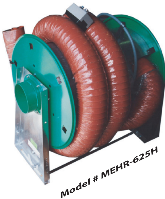
Model # MEHR-625H

The Sourcetec motorized electric hose reel "MEHR" Series is manufactured for various hose diameters which will accommodate most exhaust applications. Our standard reel is equipped with a low voltage ON/OFF switch that can be wall mounted or suspended from the reel in a compact hand held unit. Sourcetec motorized reel comprises of a two key switch device or infrared remote to control the roll up and the unwind of the hose reel and a 1/3 HP compact gear motor with self locking worm gear 110/1/60V. A low voltage state of the art micro switch mechanism controls the displacement of the hose thus eliminating any running over or under the hose on the drum. A fan and a motorized damper can be mounted directly on the reel that operates automatically or manually with the reel rotation. Operation procedure can be customized to suit.