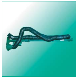
SUPER SAP Series

Fume extractor with a reach from 22' to 30'